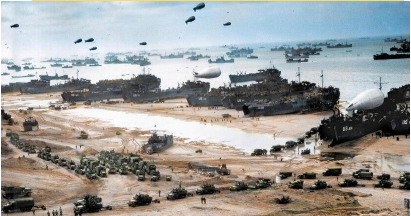
Omaha Beach 6 th June 1944.

This year is the 80 th anniversary of the Normandy Landings which began the struggle for the liberation of Europe from Nazi occupation. Combined armies of American, British and Canadians crossed the channel, and under fire took the beaches and established a bridgehead. The Americans were assigned Omaha and Utah beaches, The British forces, Sword and Gold beaches and the Canadians, Juno beach. Some British forces landed by glider at the now legendary Pegasus Bridge, the bridge over the Caen Canal and the bridge over the River Orne. This had to synchronise with the beach landings to control transport links. The picture above is a modern colorized version of the original: it gives some idea of the colossal amount of equipment, and manpower needed, and the huge amount of organisation and logistics involved.