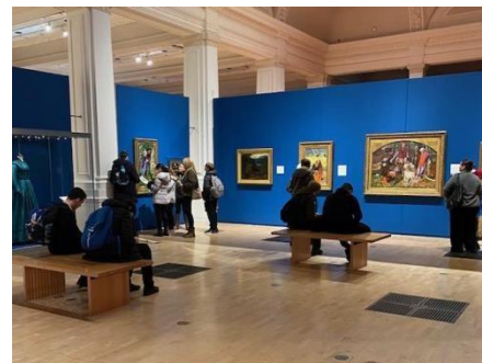
Bantock House, Wolverhampton